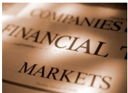
Strategic Planning & Formative Research