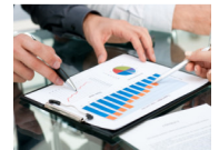
Communication Analytics and Support