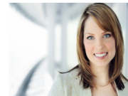
Research Implementation Support