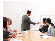
Program Monitoring and Evaluation